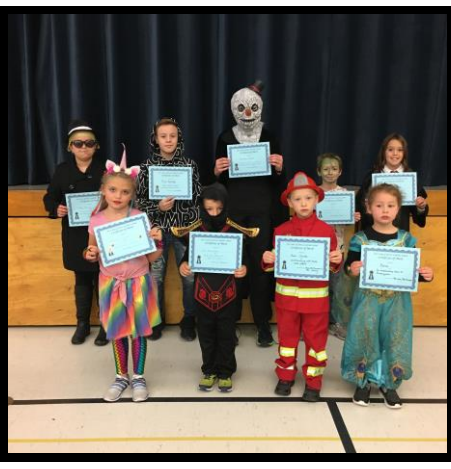
CONGRATULATIONS TO OUR OCTOBER STUDENT MERIT AWARD WINNERS!